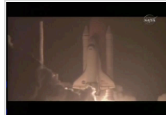
Slideshow - 15 images

KENNEDY SPACE CENTER -- The astronauts aboard space shuttle Endeavour started their first full day in orbit Saturday morning, less than a day after a spectacular nighttime launch. See previous story.